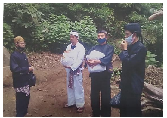
Figure 2. Departure from the Balong Dalem Tourism Object to Cikembulan

b. Departure of envoys from the Balong Dalem tourist attraction to collect water from Cikembulan. The envoys who were sent consisted of three people, namely one bride and two figures who were in charge of carrying a jug which would later be filled with water.