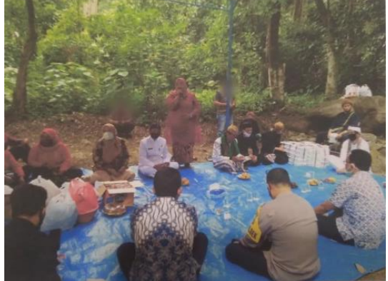
Source: Documentation of Balai Desa Babakanmulya Figure 4. Implementation of Joint Prayer

d. All the people attending the Kawin Cai ceremony sit cross-legged in front of the wedding stone, accompanied by religious leaders to pray together asking God Almighty to give blessings from the union of the two springs and to provide benefits to Babakan Mulya Village and the existing village. around Babakanmulya Village. d. All the people attending the Kawin Cai ceremony sit crosslegged in front of the wedding stone, accompanied by religious leaders to pray together asking God Almighty to give blessings from the union of the two springs and to provide benefits to Babakan Mulya Village and the existing village. around Babakanmulya Village.