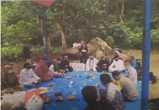
Figure 6. Closing and Eating Together

f. The Kawin Cai event will end with a joint meal among the people who have attended the ceremony.