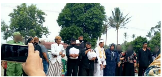
Figure 3. Water Reception from Cikembulan

Tirtayatra Balong Dalem spring right above the wedding stone.