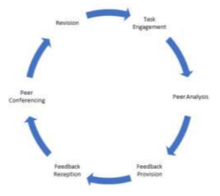
Figure 2 Peer assessment cycle

"A spectrum of acts through which individuals evaluate the work of others" is another definition of peer evaluation. A collection of individual actions used to form judgements about the work of others is characterized as peer assessment. Aspects of peer assessment consist of 6 con 210 nents, namely (1) task engagement, (2) peer analysis, (3) determining feedback (feedback p21vision), and (4) receiving feedback (feedback reception). ), (5) peer conferencing, and (6) revision(Reinholz, 2015). The six components of peer assessment can be seen in Figure 2.