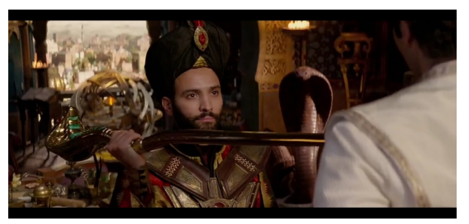
Figure 8. Jafar when threatening

In figure 8, the scene shows Jafar forcing Aladdin to admit that his servant is the Genie from inside the magic lamp. Jafar threatened Aladdin to push him into the sea if he wasn't honest, but Aladdin still claimed that he was a prince, after that Jafar pushed him into the sea until Aladdin drowned, but luckily the genie from inside the magic lamp came out because of the friction of Aladdin's hand. The genie looked for every way to save Aladdin, then Aladdin survived and came to Jafar.