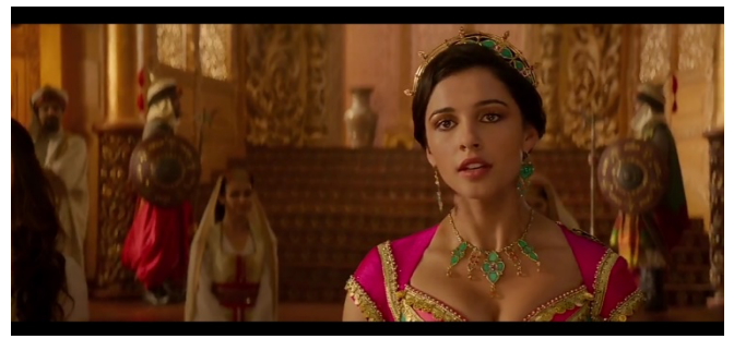
Figure 4. Jasmine

Jasmine is the daughter of the sultan of Agrabah Kingdom, she is the only child. She fell in love with Aladdin as a young man from the common people. She is very beautiful, smart and has a tall body. Her mother had died because she was killed while walking outside the palace. Thus Jasmine was not allowed to leave the palace by Baba (Sultan Agrabah, Jasmine's father). Jasmine has a caring nature for her people. Jasmine also has a brave nature she dares to change the laws of the kingdom.