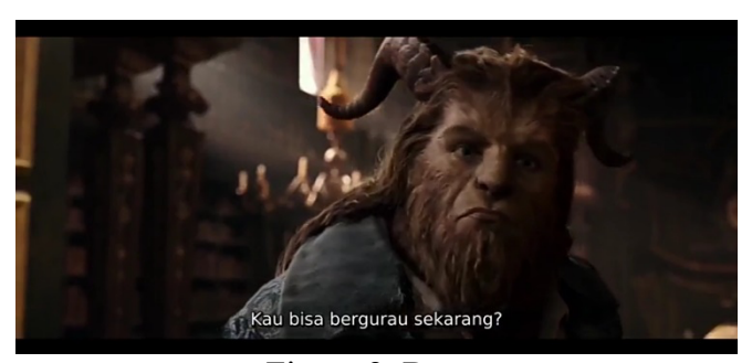
Figure 2. Beast

The second one is Beast. In the past, Beast was a handsome prince, but he grew up to be a proud and selfish young man until he was cursed to become an ugly man who was imprisoned in his castle. Beast must learn to love others sincerely and share kindness with others. To break the curse, Beast must find his true love, which is someone who can see the goodness in him regardless of appearance.