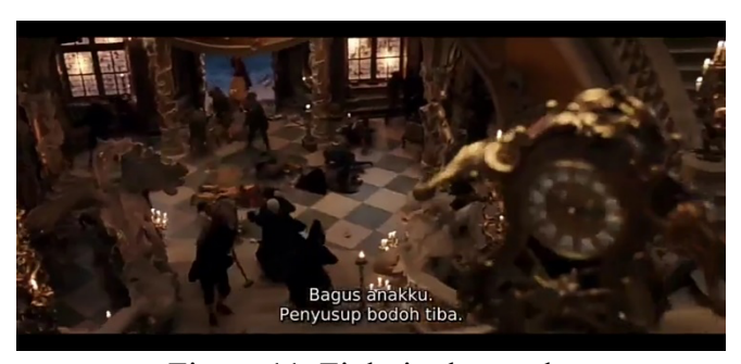
Figure 11. Fight in the castle

long story or watching a movie. Slow stories usually appeal to an older audience, while fast stories appeal to younger audience. Writers usually cut out extra words that are not important. Pacing is used to keep stories that are made quickly to avoid boredom, and made slow to pay more attention to detail. However, in the fantasy genre pacing is a shift from a tense atmosphere to an atmosphere of humor. As in the book Saricks it is said that humorous fantasy often moves more quickly from the first pages, or at least seems to do so, as it sucks readers in with the lavish wordplay (Saricks, 2009).