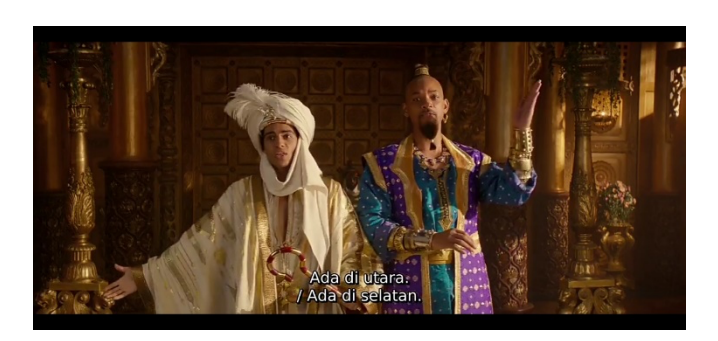
Figure 12. Aladdin and Genie

The pacing scene in Beauty and the Beast (2017) movie can be seen in the scene when Gaston and his entourage force their way into the palace to kill the Beast, but Beast's servants who are living stuff try to fight back by attacking everyone there. This scene is particularly thrilling because it is the climax of the story but changes to humor comes from people who lose to living stuff.