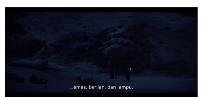
Figure 10. Magic cave

Beauty and the Beast (2019) is set in a small town in France. The town is quite calm and comfortable for its residents. But deep in the forest there is a castle that is abandoned as if without an inhabitant. The palace was cursed and forgotten by everyone. Inside was a handsome prince who was cursed to become a Beast and some of his servants who were cursed to become things, of course they were all alive. This magical thing that shows the fantasy genre in this movie.