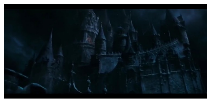
Figure 9. The cursed castle

Beauty and the Beast (2019) is set in a small town in France. The town is quite calm and comfortable for its residents. But deep in the forest there is a castle that is abandoned as if without an inhabitant. The palace was cursed and forgotten by everyone. Inside was a handsome prince who was cursed to become a Beast and some of his servants who were cursed to become things, of course they were all alive. This magical thing that shows the fantasy genre in this movie.