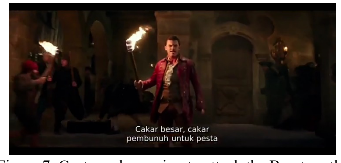
Figure 7. Gaston when going to attack the Beast castle

In figure 7, the scene shows that Gaston is influencing people to go to the palace to kill the Beast. He mentioned that Beast were cruel creatures that would threaten the lives of people there. Finally everyone went to the palace with sharp weapons, but that same night Belle managed to escape from Gaston's custody and went to rescue Beast to the palace.