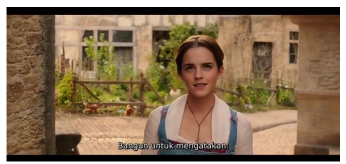
Figure 1. Belle