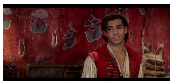
Figure 3. Aladdin

Aladdin is an orphan who has been abandoned by his parents since he was a child, he lives neglected and lives in a former tower with a monkey named Abu. Aladdin has a habit of stealing to meet the necessities of his life. But actually, Aladdin is a character who is kind, generous, not greedy and does not break his promise to his words. He stole because circumstances required him to steal so he could eat.