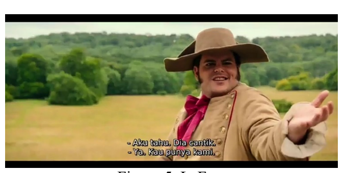
Figure 5. LeFou

Complex Character in Beauty and the Beast (2017) is LeFou, a loyal guard of Gaston, the antagonist in the story. LeFou is a new character made more feminine than the animated version. He was a man who was shy and disinclined of his master Gaston. But at the end of the story, he sided with the truth and helped the prince's followers.