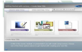
Figure 3. Inspector lektor screen.