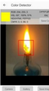
Figure 1. Flame Colors of Standard Solutions 1 , 2 and 3.