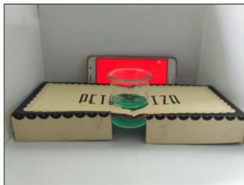
Figure 1. Set tools.

The method used in this research is Research and Development which aims to determine the concentration of NiSO 4 solution using smartphone applications. The first procedure performed in this experiment is made 3 of standard solution NiSO 4 with concentrations of 0.05M, 0.15M and 0.25M. Then prepared a series of tools as shown in figure 1.