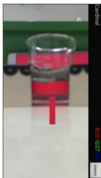
Figure 2. RGB value of aquadest.

Based on the set of tools in figure. 1, the use of cardboard box as the tool is aimed at allowing the light to pass right through the sample when measured. Then the red screen on the back of the cardboard box serves as the light source, the maximum absorbance of the coloured solution occurs in the coloured area opposite to the light source, the colour of the \text{NiSO}_4 solution is green, it will expect maximum radiation in the red area. For this system, each colour is a composite of representing the colour that looks actually [16]. The distance between the cardboard box where the sample is placed in the smartphone position must be consistent for each measurement of the solution, because if the distance used is inconsistent, it will affect the accuracy of the RGB value obtained. The measurements of RGB values on aquades and \text{NiSO}_4 unknown solutions are presented in figures 2 and 3.