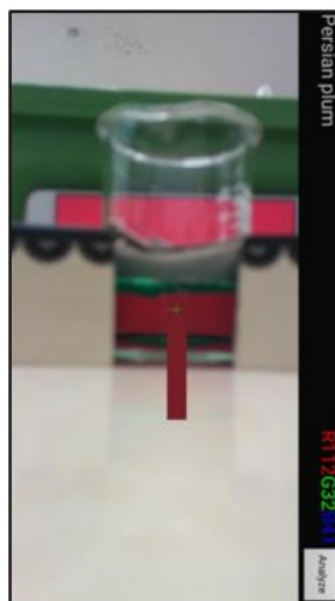
Figure 3. RGB value of \text{NiSO}_4 unknown.

Figure 2 and 3 show the results of RGB aquades measurements and unknown \text{NiSO}_4 solutions using smartphone applications. This application records the mean values of R, G, and B as shown in the lower right of figures 2 and 3. From the figure it is seen that the R value of the aquades is 207 and the