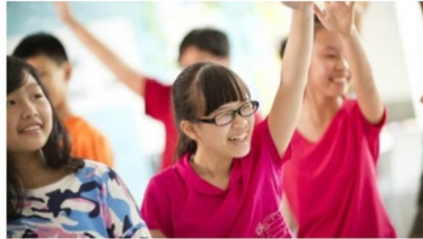
Fig.2: Student Interested and motivated

that it are regularly perceived as dull or non-beneficial to the scholar. If a student lacks the temperament to try and do one thing, this can create associate educator's activity very tough, particularly once you have got numerous opportunity pupils to cater to.