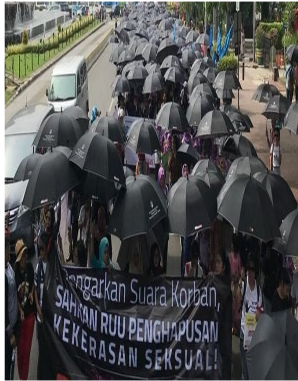
Figure 2 Mass protest on 8 December 2018 demanding the enactment of the Elimination of Sexual Violence Bill

25 October 2018. Since this time, the process of discussion of this Bill was stagnant. Therefore, Komnas Perempuan and her partners organized mass protest on 8 December 2018 asking to accelerate the discussion of this Bill. Since that time, KPPPA held many meetings to discuss this Bill with other ministries and Komnas Perempuan. However, opposition from Aila and its affiliated party, Prosperous Justice Party (Partai Keadilan Sejahtera/PKS), was also getting stronger.