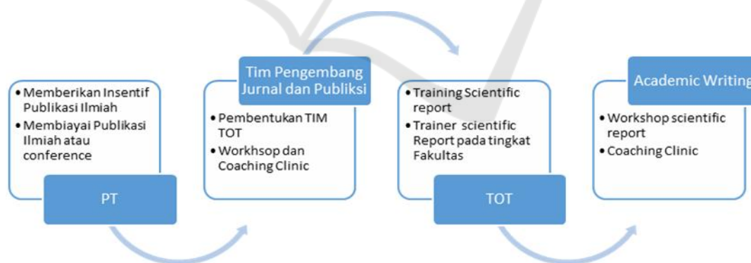
Figure 2: Flow of Activity and Policy of Publication of Research Result.

The context or process that must or is being performed is presented in chart 2 below.